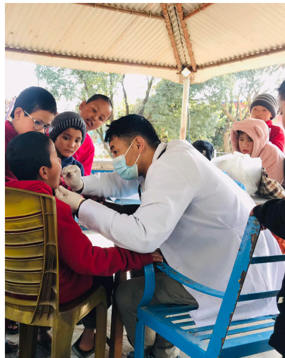
Health check at the Children's Village

The next three weeks are packed with discussions and experiences, and we are amazed how well the residents of Mustang House and the Children's Village have integrated: there are football matches between the children from the Children's Village and Mustang House; we are invited to the annual party at the Himali school, which is affiliated with the Children's Village and where our children dance; accounts are checked, salary adjustments discussed.