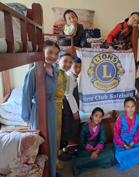
The local carpenter built the furniture right behind Mustang House, using termite-resistant sal tree wood.