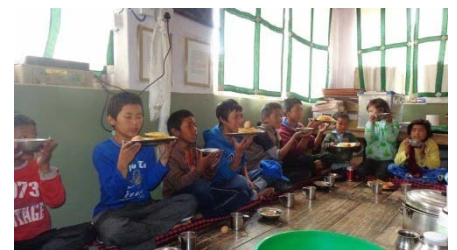
Celebrating the Dalai Lama's birthday